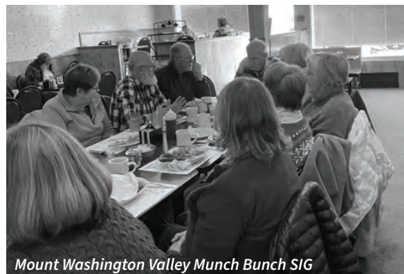
Mount Washington Valley Munch Bunch SIG