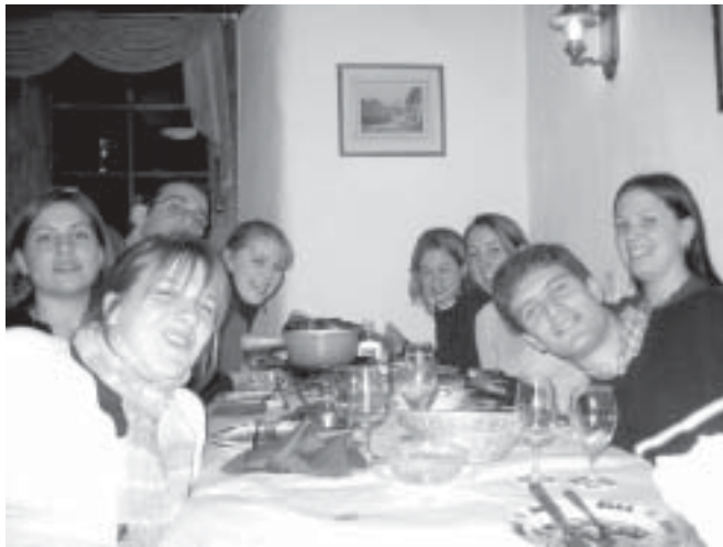
UNH hospitality students and friends out for an evening in Gruyère, Switzerland

This semester, four UNH students from the Whittemore School of Business and Economics (WSBE) are participating in a Swiss program which is designed to enhance UNH course work in the hospitality field. WSBE's new partnership with the