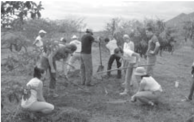
"Laboring in God's vineyard"-- or, in this case, orchard!

The average yearly salary of the people in this largely agricultural area is $600 and many villages have no electricity and have very primitive and undependable water supplies. The hurricane breached the dam that supplied the area with water, greatly reducing the supply and causing great hardship.