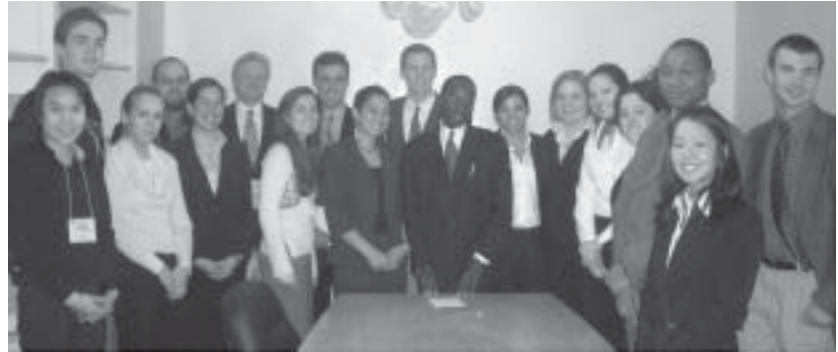
Sixteen students from UNH attended the Model UN Conference in New York City in March. Above, students pose with the UN ambassador from Niger.